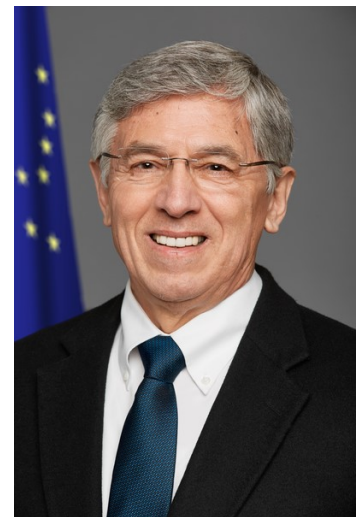
Lieutenant Governor and Chair of the Alaska Historical Commission, Byron Mallott will be joining us in Cordova.

Please be in touch if you have questions. We look forward to seeing you in Cordova!